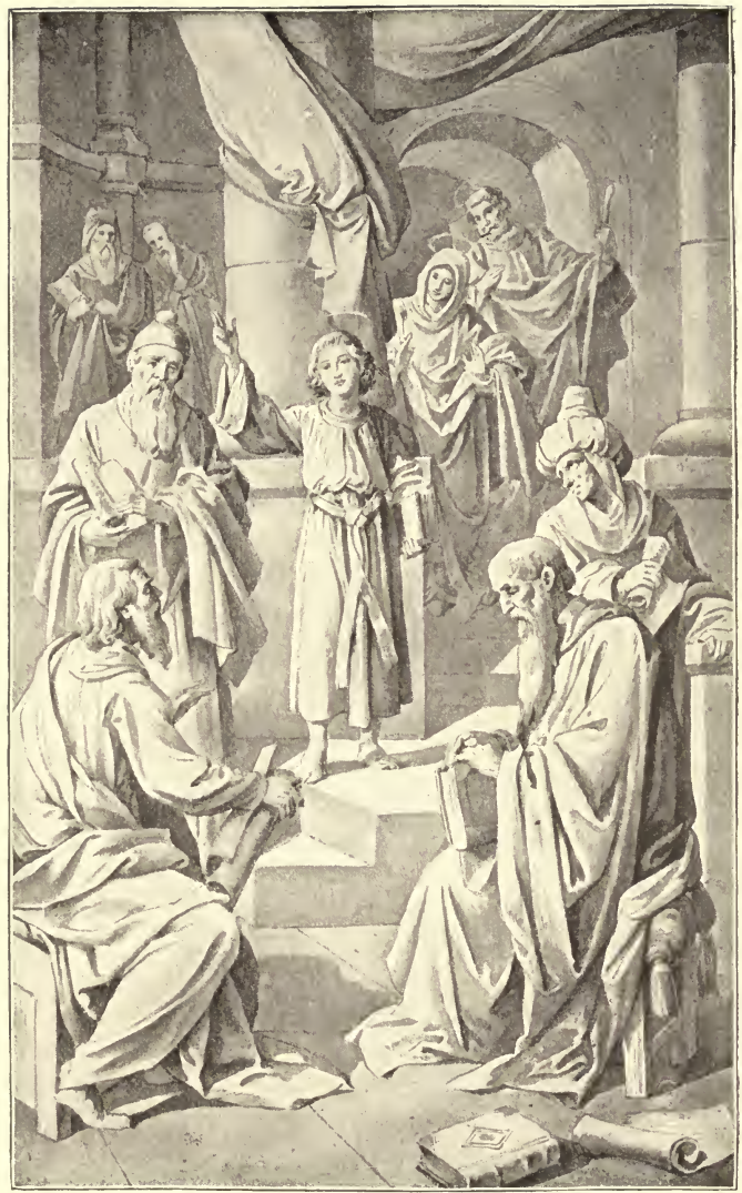
MARY AND JOSEPH FIND JESUS IN THE TEMPLE.