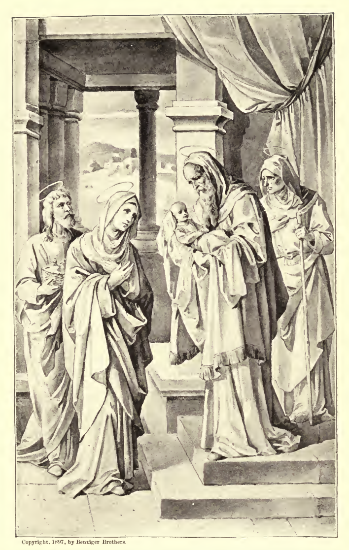
MARY AND JOSEPH PRESENT JESUS IN THE TEMPLE.