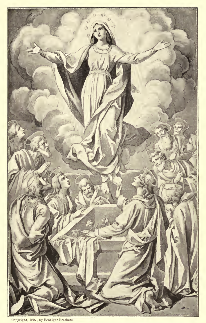
THE ASSUMPTION OF THE BLESSED VIRGIN.